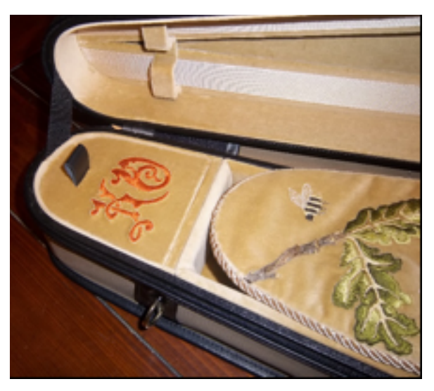
Shaped Model - Interior Pocket Case by T. A. Timms & Son; Embroidery by Janice Gail