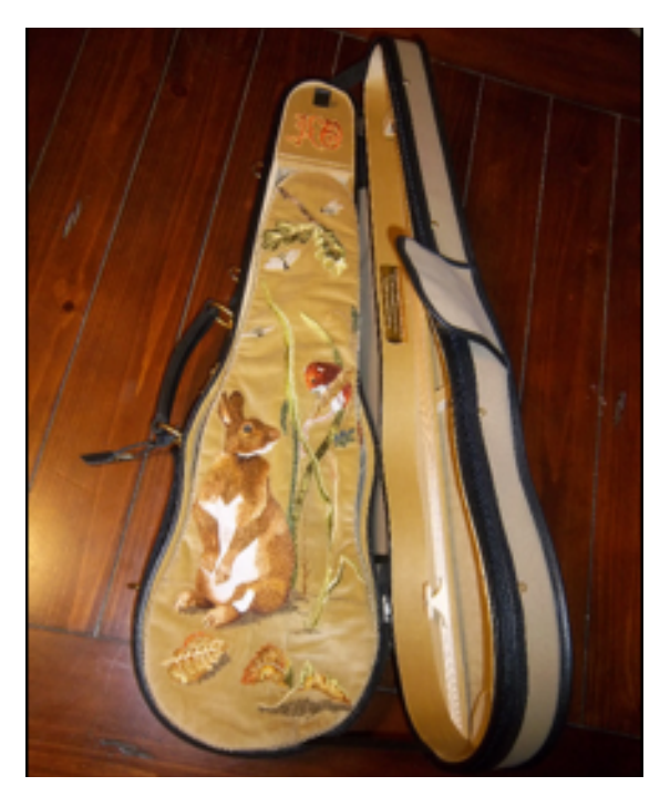
Shaped Model - Interior with Blanket Case by T. A. Timms & Son; Embroidery by Janice Gail