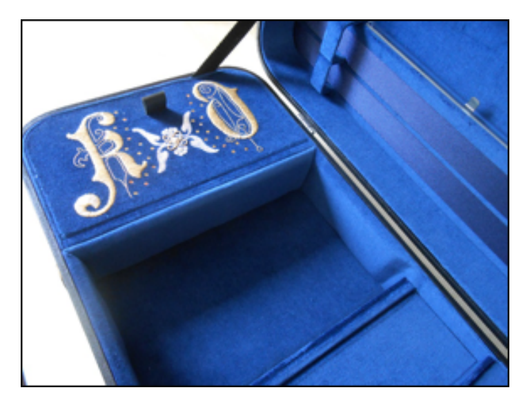
English Style (Oblong) Model - Interior Pocket Case by T. A. Timms & Son; Embroidery by Janice Gail

I ordered two cases - a shaped case for plane travel and an English model (or oblong) for daily use. Desmond asked me to provide tracings and measurements of my violin, so that the case shells could be built to size. I was also able to customize the features of each case, including choosing fabric colors, music pockets, and adding special "D" rings so I could wear them as a backpack. Finally, Desmond allowed my mother, an incredibly talented fiber artist, to create unique needlework designs on the interior fabric.