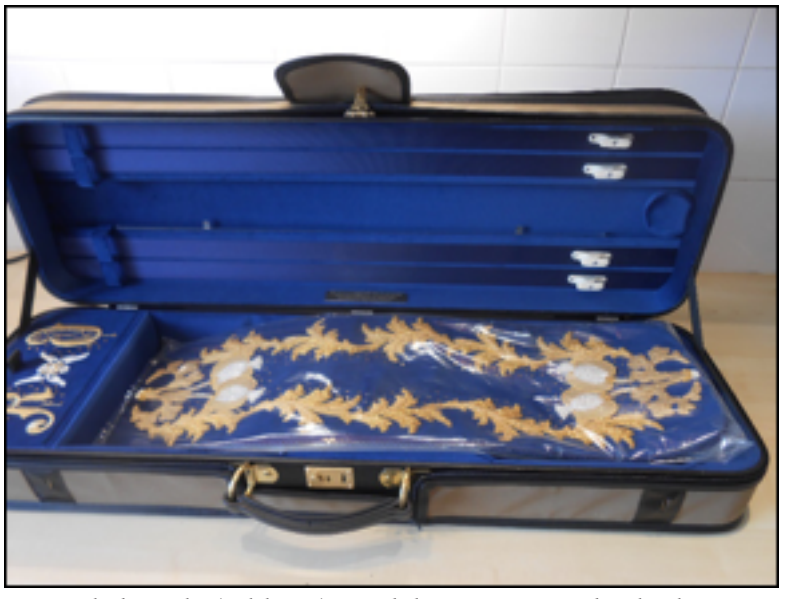
English Style (Oblong) Model - Interior with Blanket in Protective PlasticCase by T. A. Timms & Son; Embroidery by Janice Gail