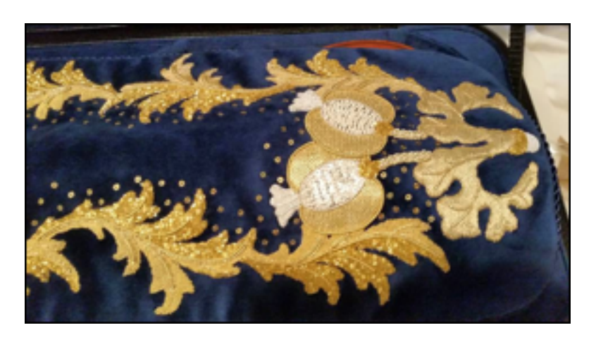
English Style (Oblong) Model - Interior Blanket Case by T. A. Timms & Son; Embroidery by Janice Gail